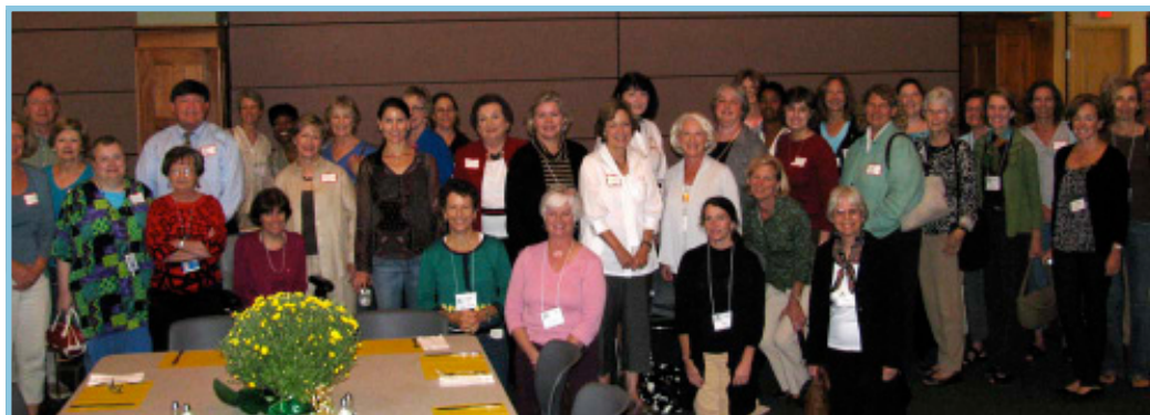
Recent Board and Tutor Lunch