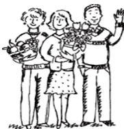
Hospital Visitation Team

PICTURES: If you have any photos of a Charter Member, or any addresses of former staff...please bring them to the church office ASAP!