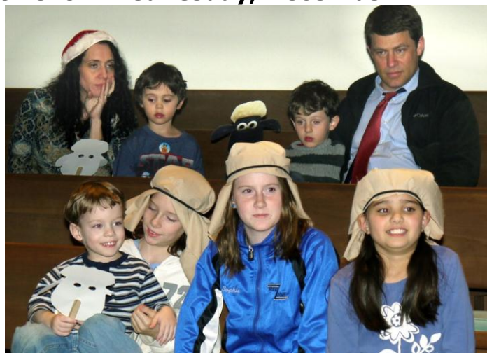
Right: Shepherds "Abiding ... keeping watch over sheep"