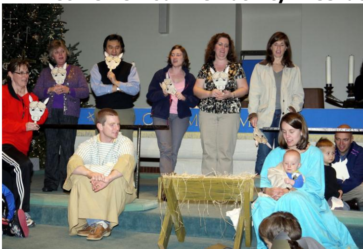
Left "Little Sheep" gather around the manger