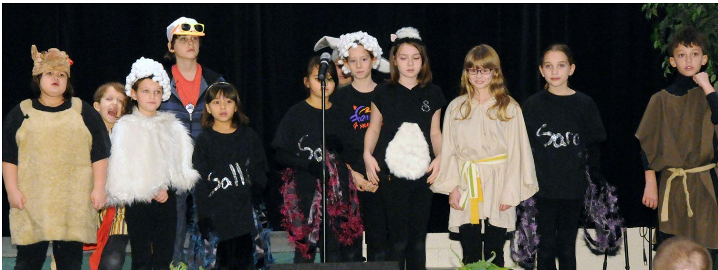
Bethlehem or Bust – Children’s Musical – December 11 (More December Children’s Photos on Page 15)

And here at Highland, we have enjoyed many wonderful, fun and inspiring activities leading up to Christmas last month! In this issue we will share some memories as well as look ahead to the New Year!