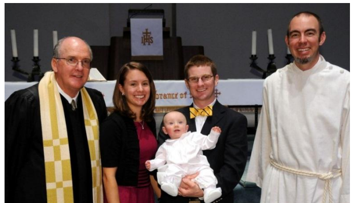
The Blalock Baptismal family as it appeared in last month's Ridge Rider