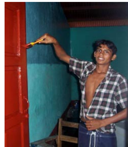
Thanks to CFUMC's support, the school at Los Playones, Nicaragua has started renovation inside the classroom. Shown above is painting being done in one of the classrooms that is being refurbished.

We will meet at Carrollton Middle School and travel to schools in the Carrollton City School System, Central schools, and the University of West Georgia.