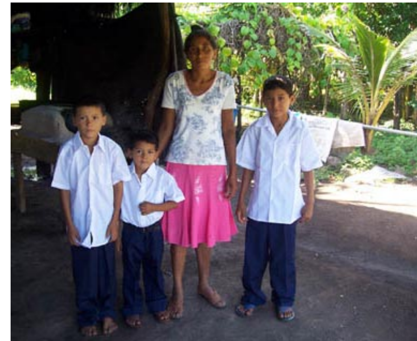
Shown above is a family who received school uniforms that CFUMC helped to purchase.