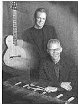
Their excellence honors God and inspires people.

Their concerts are a combination of music, storytelling and comedy as each plays off the other in a way that's entertaining and captivating. An evening with The Burchfields (two brothers who play nice together) can be described as Reaching the Ages. Prime timers love the music they recognize while young people are inspired by the arrangements and intrigued with the instrumentation.