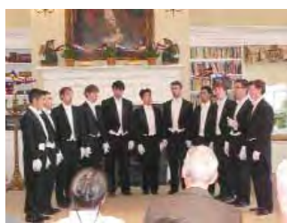
The Yale Whiffenpoofs shine in white tie.

The Trinity Pipes charmed with energy and song.