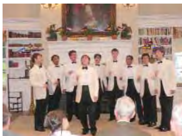
Princeton Tigertones' mellow tones purred.