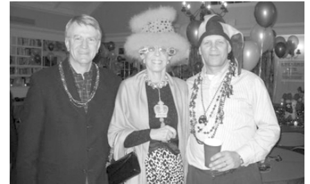
It's fun for all every year at Mardi Gras!

Feast and merriment for all ages! Get out your costumes, decorate your masks and join in the dining and dancing at St. Matthew's 2007 Mardi Gras celebration on Saturday, Feb. 10 from 6 to 9 p.m. Dance to the best Dixieland band north of the Mason-Dixon Line. For the kids, there are arts and crafts activities, a parade and the crowning of the king and queen of Carnival. Childcare will be provided for younger children.