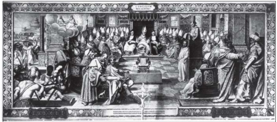
CONCILIUM NICAENUM I—fresco from the Vatican City

From the political point of view, the accession of Constantine in 305 as western Emperor of Rome was fundamental. Determined to preside over a Christian empire, he nonetheless was reasonably tolerant of other faiths, provided they kept a low profile. In 313 he and Licinius, his fellow emperor for the east, issued a joint proclamation establishing Christianity for the empire: the so-called Edict of Milan. However, the initial harmony between the emperor (Licinius married Constantine's sister the same year) was short-lived. From about 318 to 320, relations had deteriorated to the point that Licinius had begun to forbid the holding of synods and began harassing Christians in petty ways. These actions came at a critical point for Constantine, who was facing a growing heresy known as Arianism, after the dissident priest Arius, in the