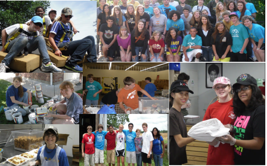
2011 Summer Youth Mission Trips