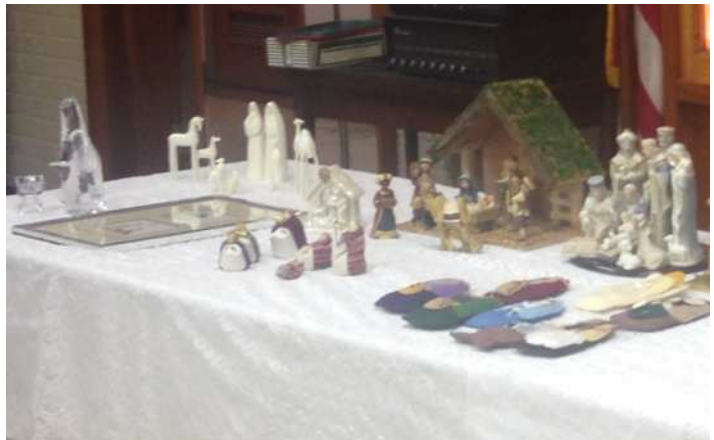
Above and below: “Bring your crèche to church” display.