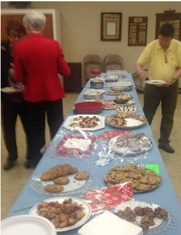
Above: St. John’s Cookie Exchange.