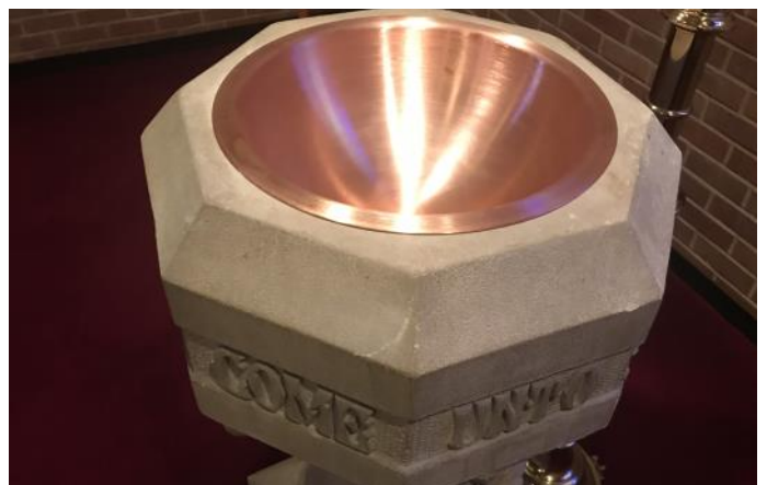
A preview of the new bowl for the Baptismal Font.