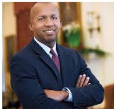
Bryan Stevenson, Founder and Executive Director of the Equal Justice Initiative