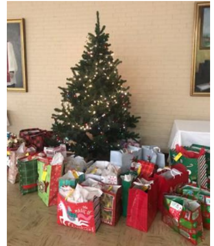
The packages around the tree ready to be delivered.