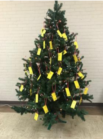
We started with the tree and the tags.

COVID-19 made some changes in this year's project: Outreach Committee members did more shopping and wrapping; we all didn't get to see the presents under the tree; the Saint John's delivery elves could not go into the Azalea Gardens facility. But the project was a success! Thank you for being part of bringing the spirit of Christmas to a small part of the world.