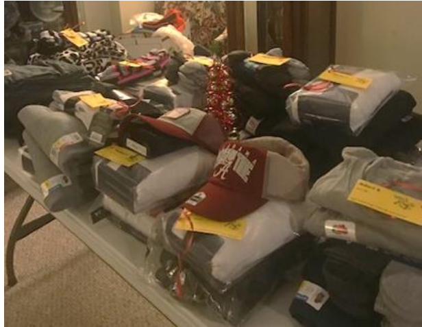
Outreach members shopped for those who needed "shopping service" this year.