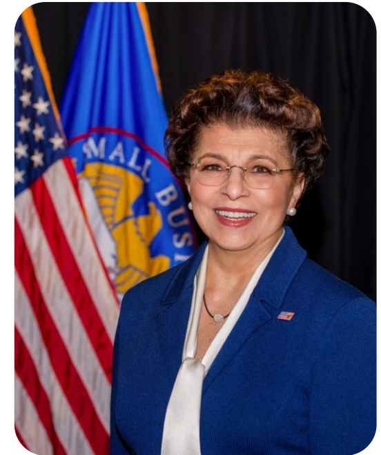
Administrator Jovita Carranza

Upon a request received from a state's or territory's Governor, SBA will issue under its own authority, as provide by the Coronavirus Preparedness and Response Supplement Appropriations Act that was recently signed by the President, an Economic Injury Disaster Loan declaration.