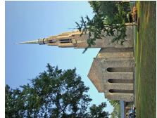
Invite someone to church.