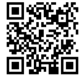
Scan with your smart phone to go the church's website.