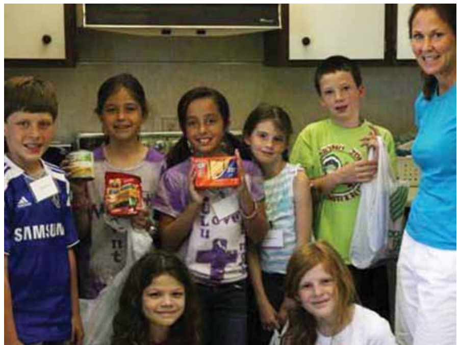
(Images top to bottom) Vacation Bible School kids helped to collect items for the Justice and Peace ministry this past summer. The food pantry is always in need of staples.