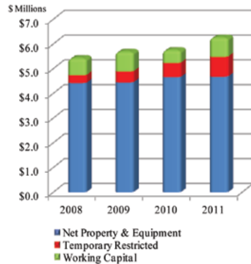
Total Net Assets

Assets on the balance sheet consist of cash and savings, and the net carrying value of the physical plant of the Church and School. Cash and savings, including temporarily restricted funds, totaled $1.639 million and $1.147 million for the years ending June 30, 2011 and 2010 respectively. Temporarily restricted funds totaled $0.798 million and $0.572 million for the same time periods leaving unrestricted cash and savings of $0.841 million and $0.575 million for the years ending June 30, 2011 and 2010, respectively. The cost of property, plant, and equipment net of accumulated depreciation was approximately $4.460 million as of June 30, 2011 compared to $4.663 million in 2010. Total assets were $6.099 million and $5.811 million as of the fiscal yearend 2011 and 2010.