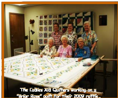
The Ladies Aid Quilters working on a "Briar Rose" quilt for their 2009 raffish.

You are invited to come....to bring children, grandchildren, nieces and nephews, neighbors and friends.