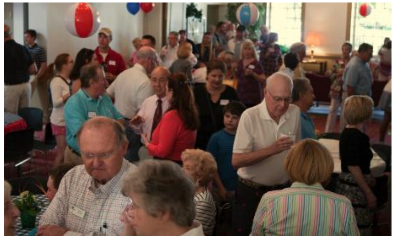
Close to 300 parishioners enjoyed fun and fellowship at the parish-wide picnic this past June.

The information contained herein is intended for general information purposes only, does not constitute legal advice, and is not guaranteed or promised to be accurate, current or complete. You should not rely or act on this information without first seeking qualified legal counsel.