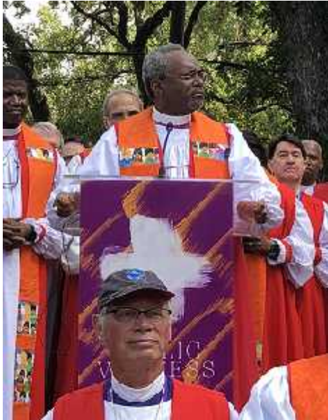
Bishop Curry speaking at the "Bishops United Against Gun Violence" gathering during General Convention.

During convention, the House of Bishops and the House of Deputies met three times in joint sessions. During these meetings, speakers presented a powerful witness in the areas of Racial Reconciliation, Evangelism and Care of Creation.