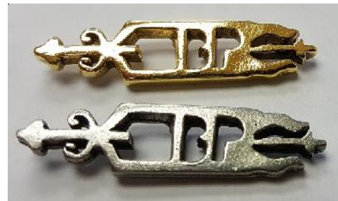
First Year Membership