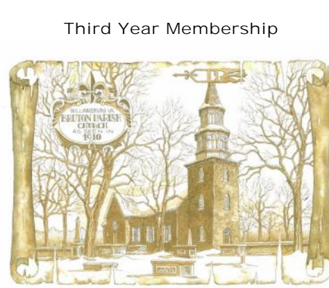
Third Year Membership