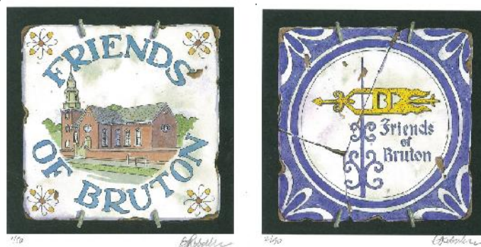
Second Year Membership