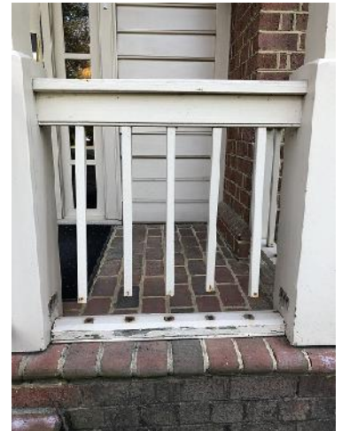
Photos of the broken railings on the Parish House porch prior to Bruton Builders Team's work.