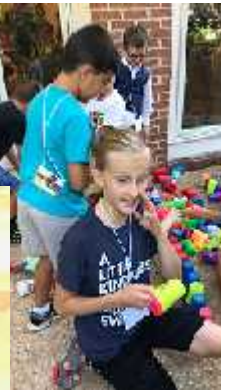
Fun in the Sun at the End of Summer Pool Party for Families with Children & Youth

Nursery is available each Sunday in the Parish House from 8:30am through the 11:15am service for newborns through 4-years-old.