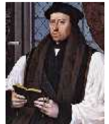
Archbishop Thomas Cranmer, a leader of the English Reformation

Thomas Cranmer: A Life (283/MacT). Written by Diarmaid MacCulloch, this book is a biography of the Archbishop who guided England through the early Reformation and led the drafting of The Book of Common Prayer.