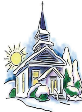
Christmas Day Worship Service