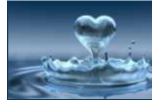
...no matter how small a deed or action you muster, the effects are like a ripple in a pond. Newton - 1675