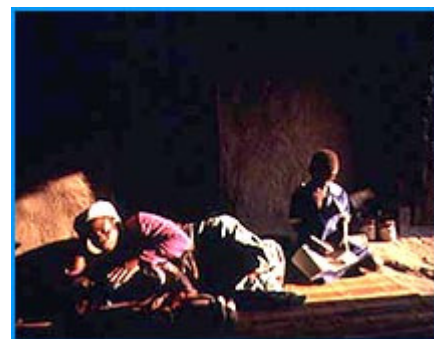
A girl orphaned by AIDS shares a floor mat with her foster mother who rests with a baby in their house in Mapete Compound in the town of Kitwe, central Zambia

But African nations spend only $165 million a year to combat AIDS, and it all comes from the industrialized nations. James Wolfensohn, president of the World Bank, told the U.N. Security Council in January 2000 that an effective and comprehensive prevention program for sub-Saharan Africa would cost $2.3 billion a year.