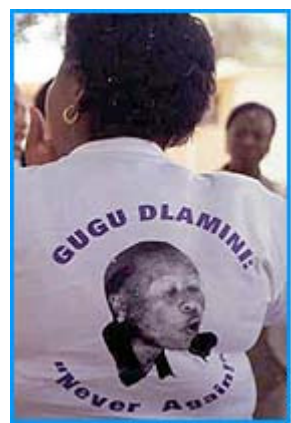
A woman in South Africa wears a T-shirt bearing the name of a woman with AIDS who was killed by fellow villagers