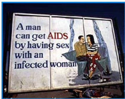
Billboards carrying AIDS prevention messages are becoming more common in central Africa. This was one in 1995 in Zambia's capital, Lusaka

Given the variables and incomplete reporting on the epidemic, it is difficult to assess its economic impact with any precision. But there have been estimates that the per capita income in most sub-Saharan countries has declined by 20 percent.