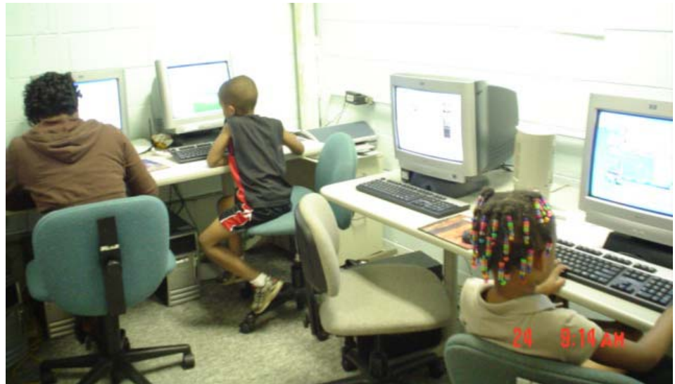
Children enjoy computer time at Brightwood Community Center.

All of the above plus: Pens Highlighters Ruled Index Cards