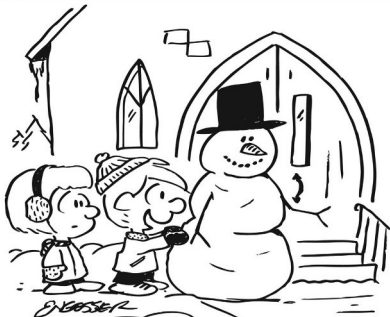
"He's today's greeter."