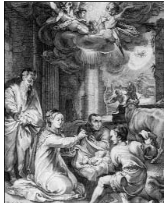
The Adoration of the Shepherds (detail), by Hendrik Goltzius, engraving, 1594.