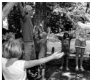
Scene from Day Camp 2010