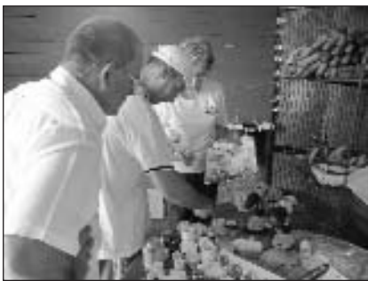
Volunteers work on clean water project

Two years ago, that spigot and water did not exist. Westminster has had a wonderful history with our