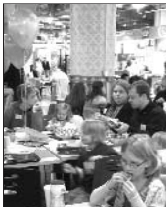
Nursery families at Midtown Global Market