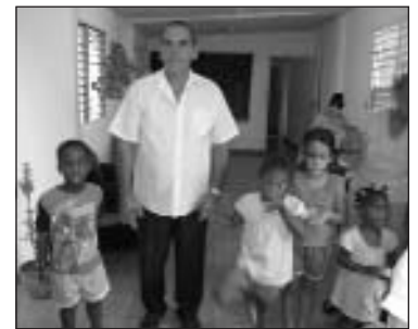
Director and residents of orphanage in Matanzas where clean water system was installed.

installed another clean-water system at an orphanage in Matanzas. The water not only serves the children and staff of the orphanage, but the people of the neighborhood and surrounding community as well. Likewise at the seminary, people traipse through the gates with buckets and bottles hourly, toddlers and babies babbling as their faces get a splash of the refreshing stream. The water not only provides health, it provides a community bond, a flowing source of life and connection for the people who drink it. And I, a month-long visitor at the seminary, discarded my bottled water and Pepto-Bismol, and confidently lifted a glass up to the spigot next to my Cuban friends. We were brothers and sisters, brought together by the hot Cuban sun and the possibility of community.