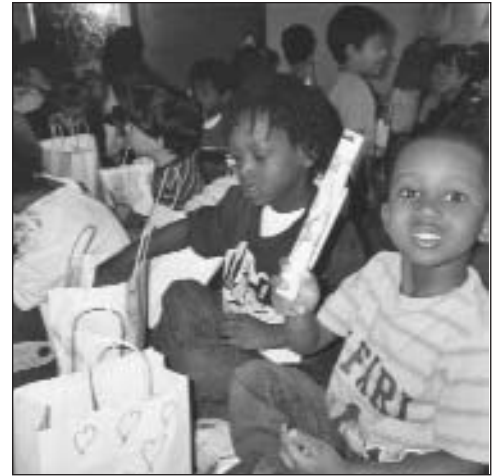
Children in the YWCA daycare program received gifts of toys and books as part of Westminster's Friendship Fair.

Thank you to teachers, parents and members in the congregation who support the enthusiastic efforts of our children to aid people in circumstances of need.