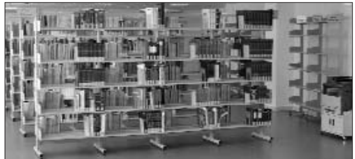
Shelves to fill at Dar al-Kalima College

The only way that books make their way to the library is in the suitcases of visitors. I will carry a suitcase full of books particularly chosen for my class, and then donate them to the library. Westminster also desires to enrich our relationship by acquiring several additional works of art from the students and faculty at the college and cultural center. Please let me know if you would like to participate in funding the purchase of books, or the acquisition of art.