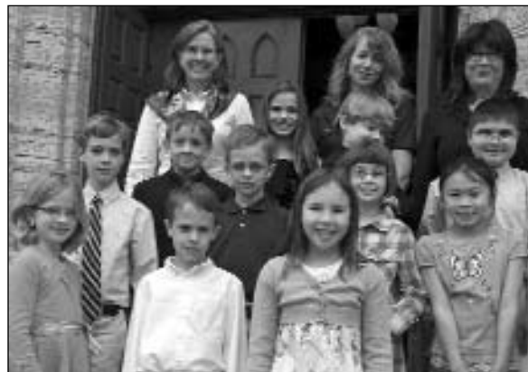
Left: 3rd Grade Bibles