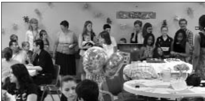
Fiesta with Familia de Fe

Our Spring Fiesta! was a wonderful meal and celebration shared with members from Westminster partner church, Familia de Fe . Familia de Fe provided cooks, musicians, and a children's choir to help create an international atmosphere. Our Cherubim and Seraphim choirs also shared songs while members of the congregation dined on delicious food accented by flavors from South of the Border.