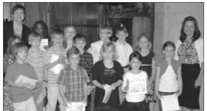
Above: 2nd Grade Worship