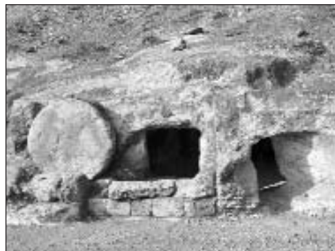
An illustration for I am the resurrection and the life. A stone literally rolled away revealing an open cave; taken on the road from Caesarea to Megiddo.

Spring 2013 brings the Jewish Women Prayer Circle back to the Westminster Gallery with work that will result from their year-long study of creation. Their insight will provide us with new ways to think about the creation of and nature of the universe.