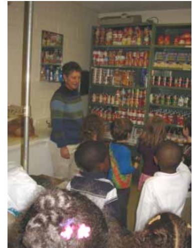
Food for only two days.

The Pre-K and Preschool classes of the Child Development Center went to the Outreach Center to learn more about the work there. In the week prior to their visit the CDC children collected over 170 cans of food for the Center. The children were excited to see the shelves of food they had brought, but were surprised that what seemed like a great deal of food was, in fact, only a two-day supply.