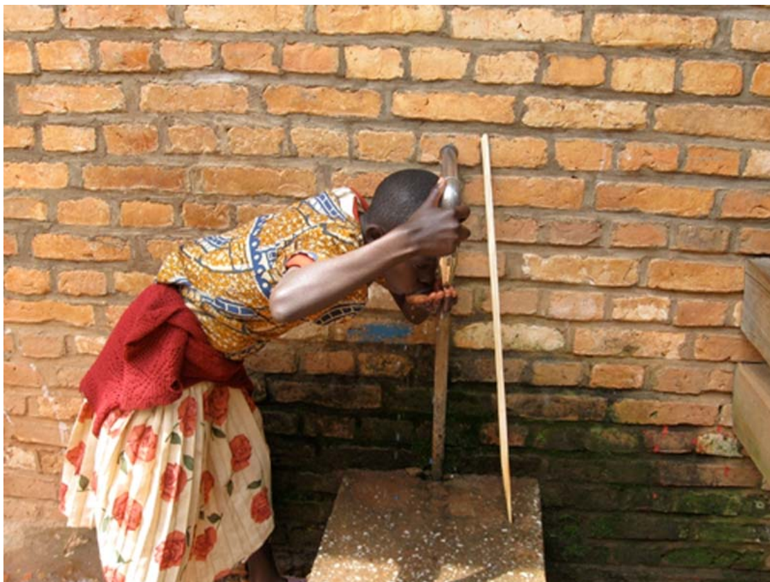
Girl Drinking Water in Rwanda