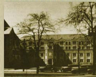
Architects - Dougherty & Gardner