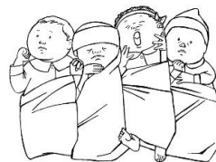
Success by Six

Circle 1 continues to make quilts for "Success by Six." They are in need of appropriate cotton or cotton blend material for baby quilts. If you have suitable material you would like to donate, please bring it to the church office. Circle 1 members donated 22 hand made baby quilts in the month of December for this program through the United Way of Etowah County.