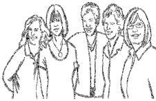
United Methodist Women

This Sunday, January 17th will be the installation of the new UMW Executive Board officers and circle officers. The installation service will be included in the Celebration Service at 9 AM.