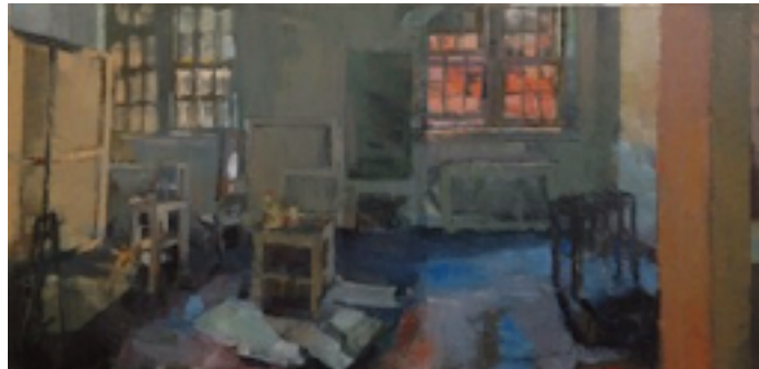
Yolande Heljnen— Studio