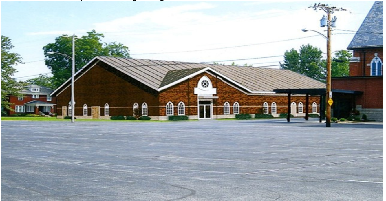
The entrance facing south with church offices running alongside of the current driveway between the church and current office house with redesigned entrance to the proposed building.