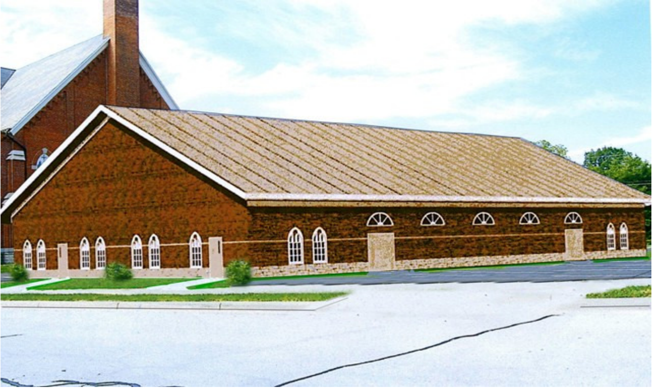
North-Side of the Proposed Building Facing SR 219.