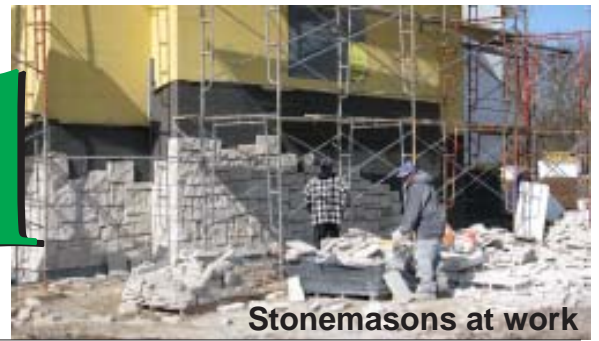
Stonemasons at work

The Monthly Newsletter of St. Mary Magdalene Episcopal Church, 13145 State Line Road, Kansas City, MO 64145