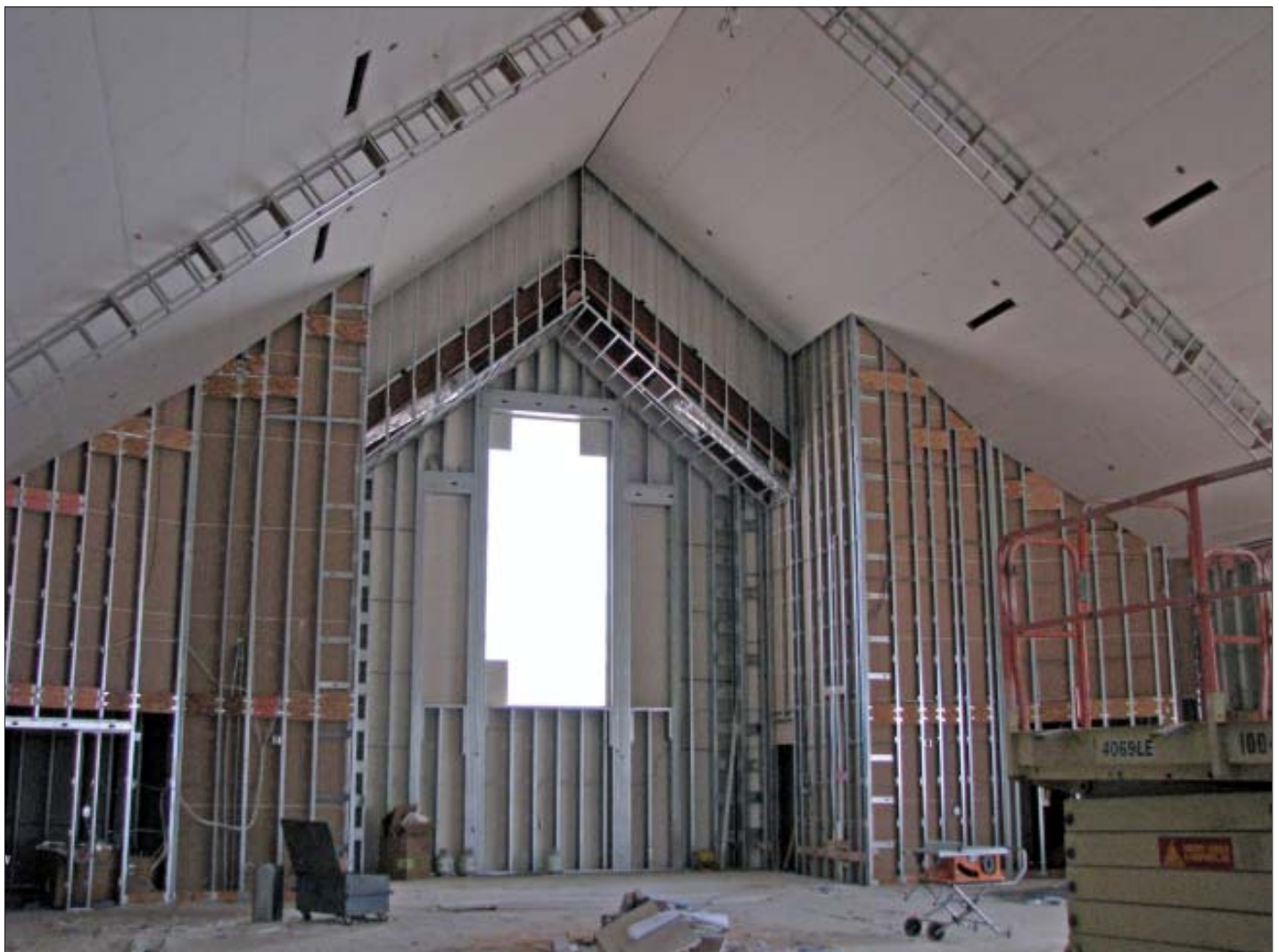
A view of the future site of countless celebrations of our relationship with God