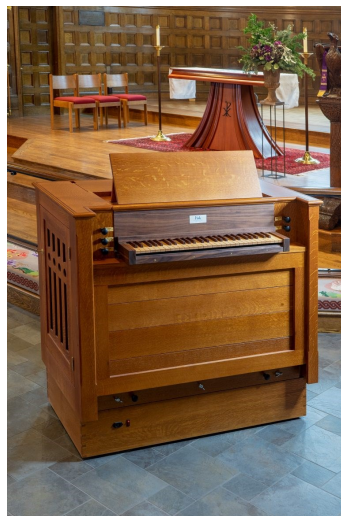
FISK Opus 157