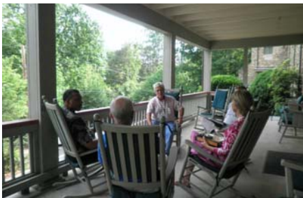
William Black Lodge Montreat, NC