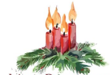
Advent Devotions 2019