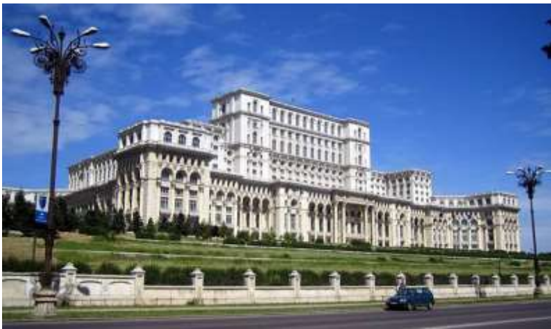
Palace of Parliament, Bucharest