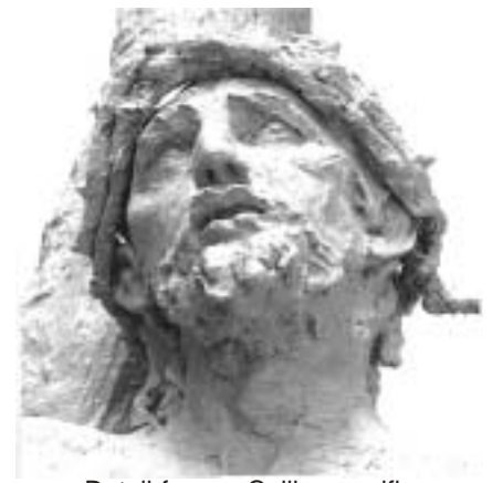
Detail from a Collier crucifix