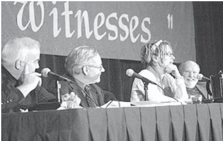
Jim Wallis, E.J. Dionne, Anne Lamott, Fr. Richard Rohr

St. Peter’s parish was well represented among the 1,790 men and women from 49 states and 6 foreign countries who attended the first “Politics and Spirituality Conference” in Washington, DC, January 14-16. Participants heard 3 dynamic speakers stir them first to contemplation and then to action.