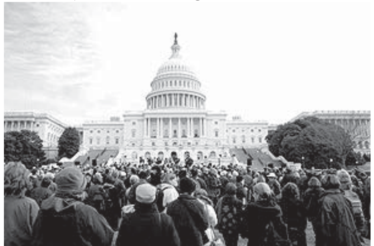
Prayer walk and service in honor of Martin Luther King, Jr.

The weekend concluded with a public Prayer Walk and Witness at the U.S. Capitol on Martin Luther King Day. The conference, which was sold out and had an overflow room for 300 extra people, was timely for a nation torn and divided by political strife and seeking a way to find understanding and compromise in order to grapple with such issues as the environment, social justice and world hunger.