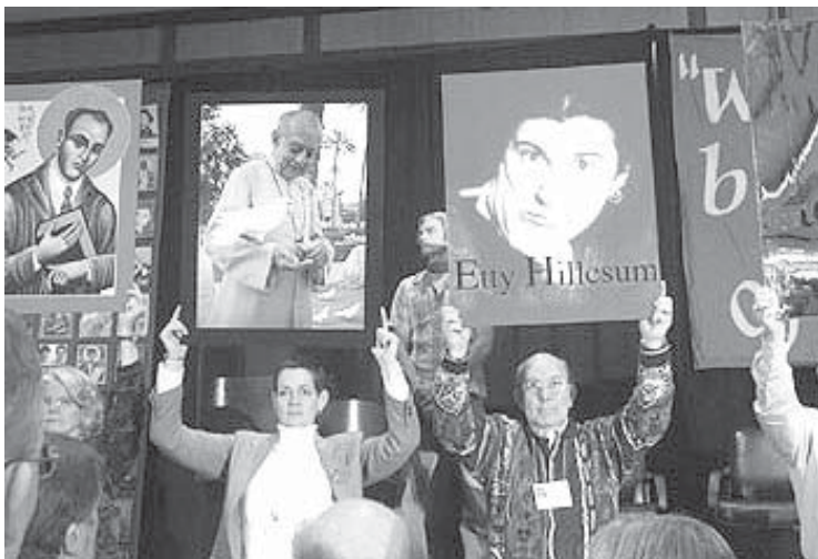
Banners of some “witnesses”: Franz Jaegerstaetter, Dom Helder Camara, Etty Hillesum

The conference opened with a beautiful prayer service centered on a reading from Isaiah 32:16-18: “In the wilderness