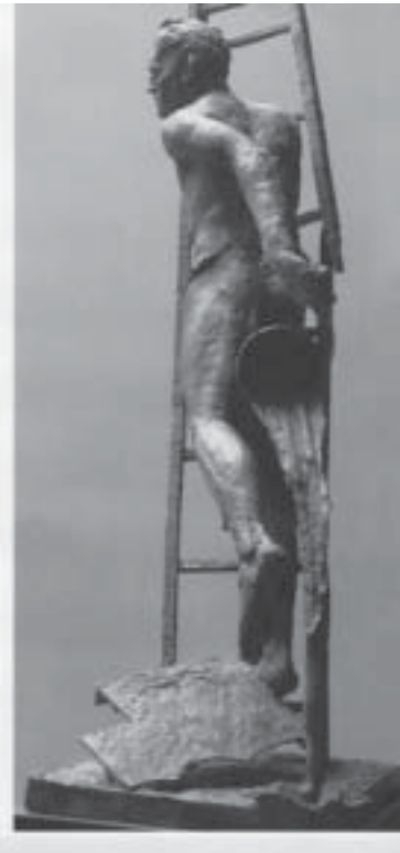
St. Florian, patron of firefighters, at Ground Zero memorial