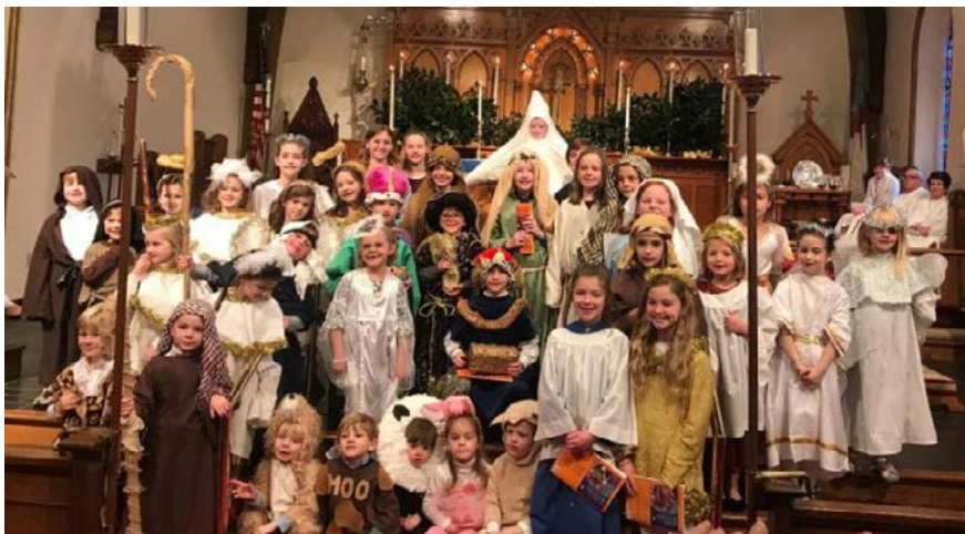
What a joyous Christmas pageant! We are grateful to our directors and parents for their support.

The ACC staff prides itself in offering the parish and community a quality program for children from six months of age through 4K. Registration for the 2019 - 2020 school year is underway. Please email the ACC office at kborowski@churchofadvent.org or call the office at 864-585-7143 if you have any questions or would like to make an appointment to tour the facility.