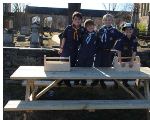
The Bear Cub Scouts completed building a new picnic table for outside of the Scout Hut!