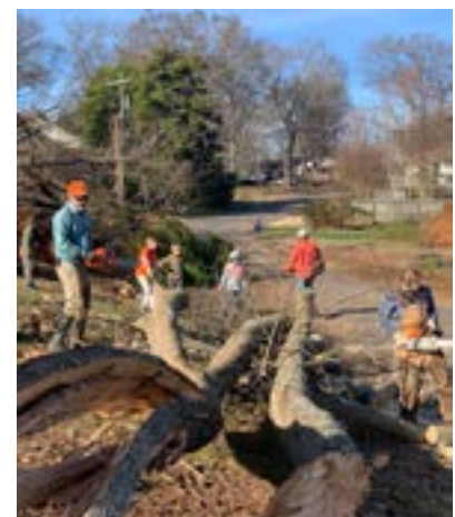
Cub Scouts of Pack 1 and assistant scoutmasters assisted with tornado cleanup. We are thankful for these helpful Scouts!