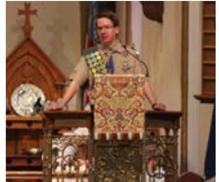
Photos: Scout Sunday and children's valentines for Charles Lea Center residents.

Serendipity, Lunch Bunch, and EpiscoPals do not meet in March. We hope to see you at the Lenten programs. Serendipity and Lunch Bunch will meet again April 13 and EpiscoPals on May 13.