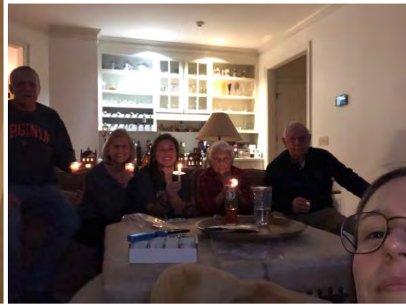
The Crosby Family