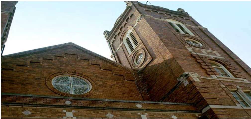
OPENING WINDOWS TO CHRIST